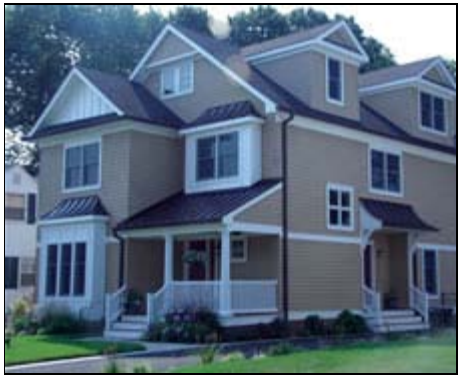
Approximately 2,760 sq. ft. — Two Story