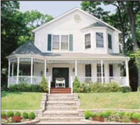
Approximately 2,975 sq. ft. — Two Story