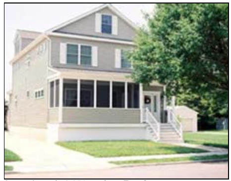
Approximately 2,350 sq. ft. — Two Story