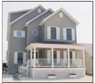
Approximately 3,200 sq. ft. — Three Story