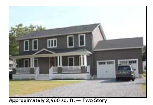
Brielle, NJ Monmouth County