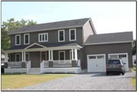
Approximately 2,960 sq. ft. — Two Story